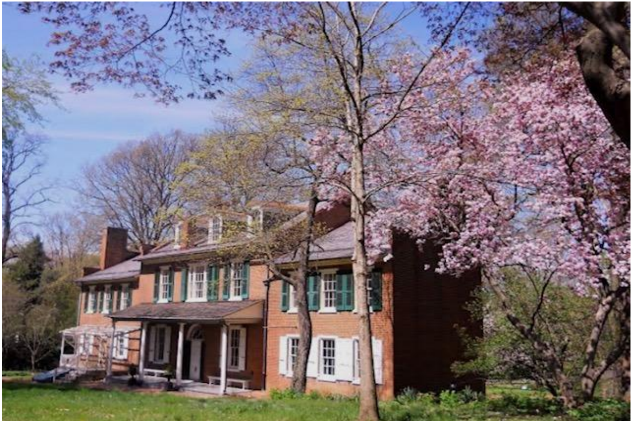
President Buchanan's birthplace in Franklin County, Pennsylvania